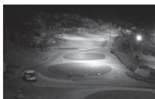
[ General Camera ]