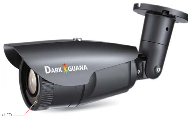
Camera Status LED