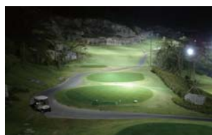
[ Dark Iguana Camera ]