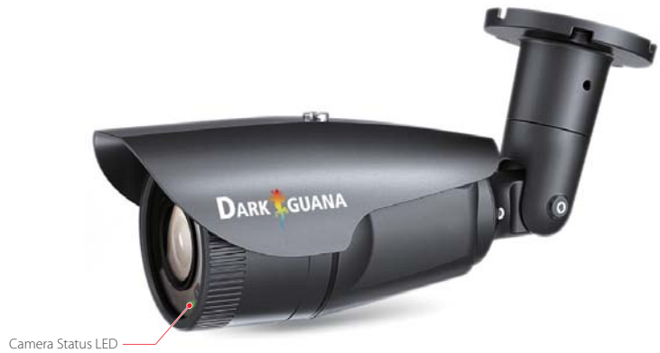
Camera Status LED